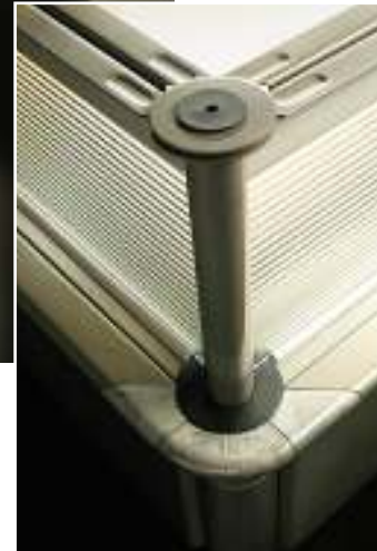
Detail: ribbed glass panels.