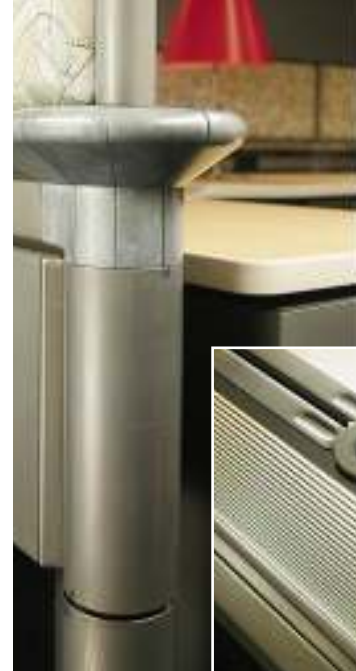
Detail: natural metal finish.