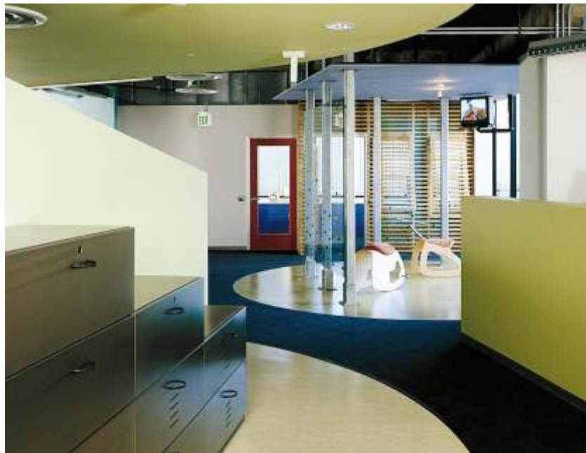
Curvy, wave-like walls and a bank of Crossings lateral files lead into a corner lounge furnished with "ponies," concept seating from Haworth.