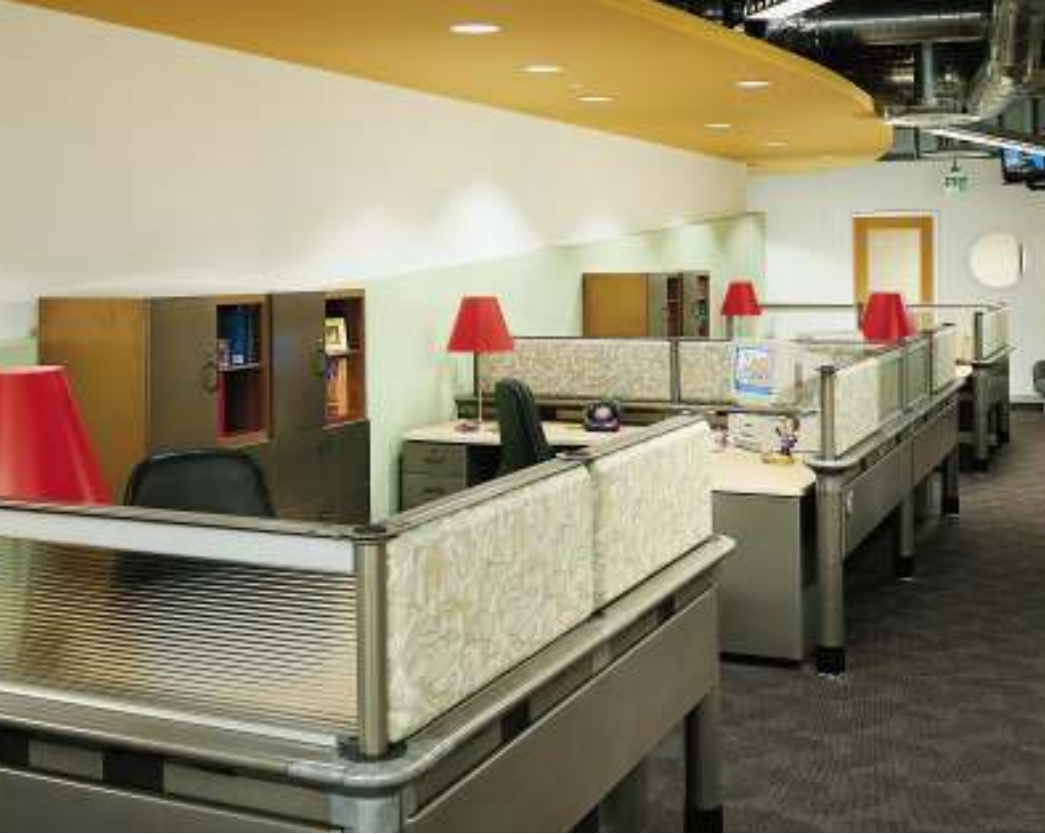
Enhancing RACE with a natural metal finish and ribbed glass puts an MTV spin on its unique aesthetic.