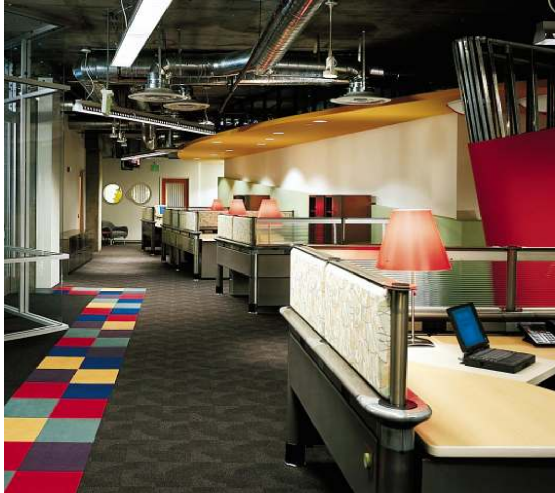
The ribbed glass panels on RACE give MTV Networks' employees a "looking-out-the-kitchen-window" perspective on work.

Sun, sand, and surf can be seen in the fifty-foot surfboards hanging from the ceilings and the curvy, wave-like walls on the second and fourth floors. The third floor houses production and project teams arranged in RACE work stations centered around "kitchen" tables for teaming.