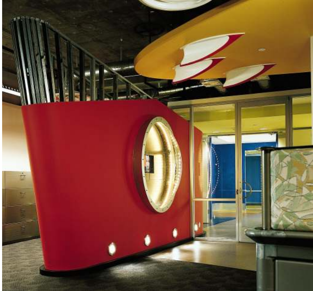
MTV Networks connects to its seaside location by using a stylized oceanliner for a reception station.